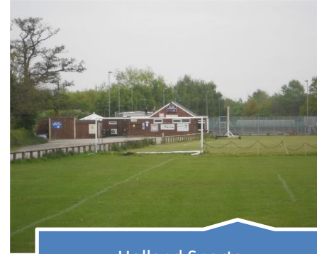
Holland Sports Club House and Some Grounds