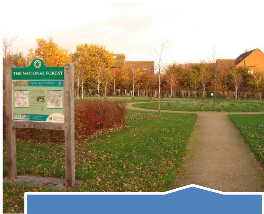
Ash Tree Pocket Park