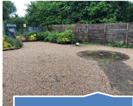
St James Pocket Park