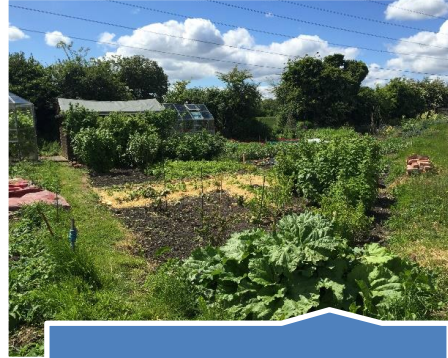
Efflinch Lane Allotments