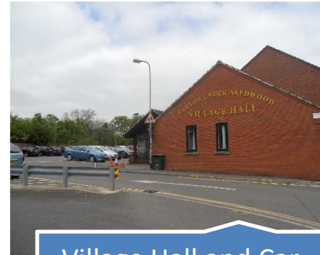
Village Hall and Car Park