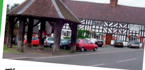
The Goat, Abbots Bromley